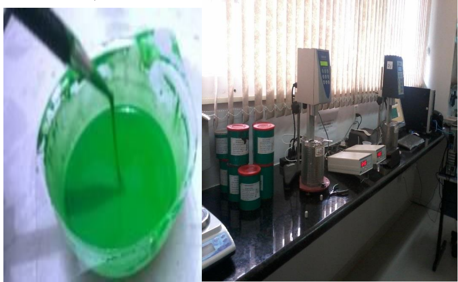
Fig. 1 Representation of dilatant fluid.

Soon the rheological study qualify the folder. Since, according to Souza et al (2011) it is possible to identify the characteristics of a given fluid. A fluid is as a substance that continually deforms when it's submitted a constant effort, no matter how small is this effort. Of all the properties of the fluid, the viscosity requires greater attention in the study of the flow of a fluid (Lopes, 2010).